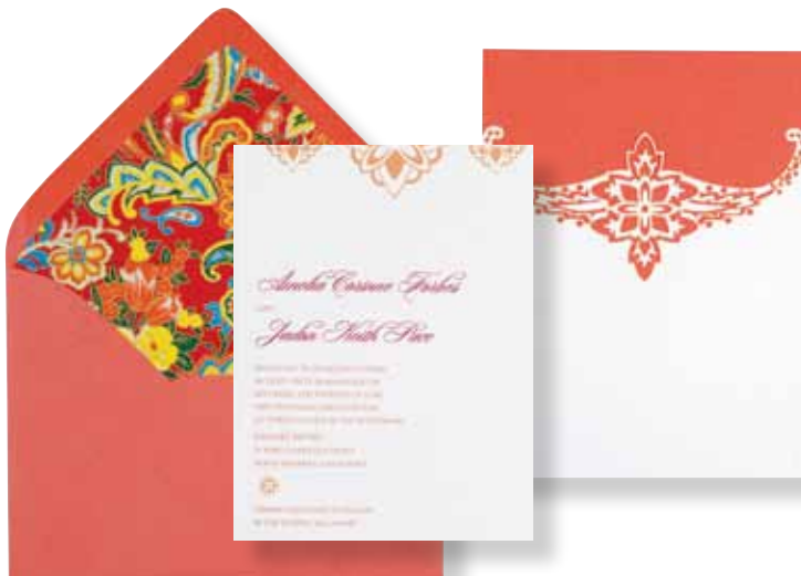
"Spanish Elegance" invitation with laser-cut pocket detail and lined envelope by Zenadia Design ; zenadiadesign.com