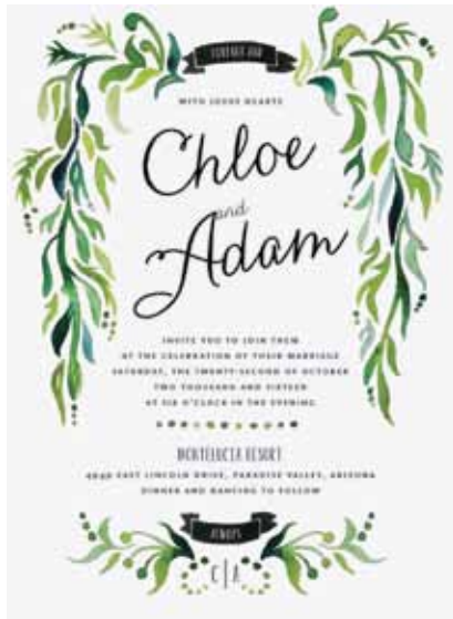
"Lavish Laurel" invitation by Whitney Port for Wedding Paper Divas; weddingpaperdivas.com