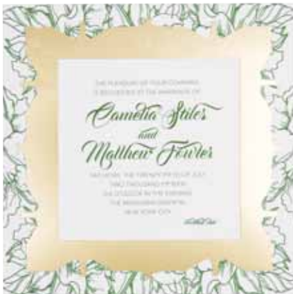
Modern wedding invitation with gold chrome frame by RedBliss Design; redbliss.com