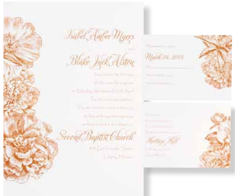
"Vintage Peonies" invitation, response card, and reception card by Carlson Craft ; carlsoncraftproducts.com