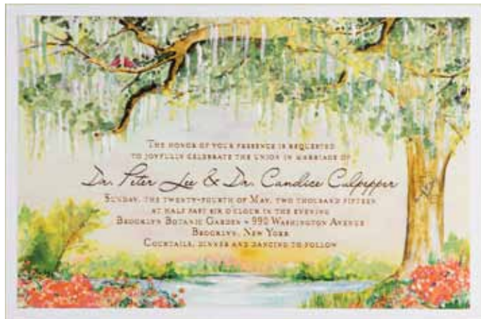
Invitation featuring a forest scene with rose-gold foil, watercolor, and handpainted acrylic foliage details by Momental Designs; momentaldesigns.com