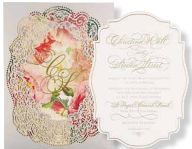
Floral gold-engraved die-cut invitation with laser-cut lace sleeve by East Six Invitations ; eastsix.com