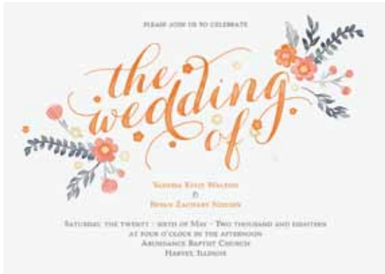
"Heart and Whimsy" wedding invitation with watercolor design by Invitations by Dawn ; invitationsbydawn.com